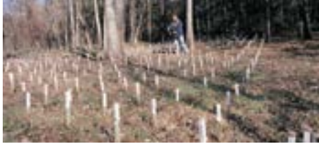
The effectiveness of preservatives at various retentions in different species is evaluated using test stakes.

Wolmanized® pressure-treated wood (poles, piles, timbers, posts, or plywood) is pressure-treated to various retention levels that are intended to protect the wood for particular applications. Retention levels indicate the amount of preservative retained in the wood